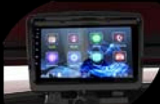
9 inch touchscreen with back-up camera