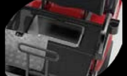
Plastic rear seat kit with storage & cup/cell phone holders