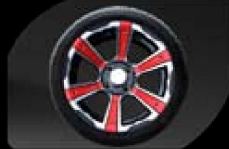
14"Alum Wheel with black insert/215/35R14 Radial DOT Tire