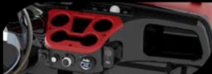
Color matched Dash with four cup holders/cell phone holder