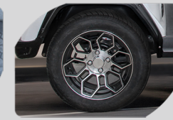
Tires for Lsv Models