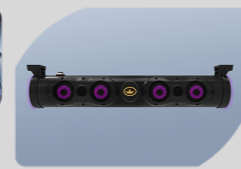
Cylindrical Evolution Sound Bar