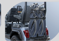
Optional Golf Bag Holder