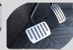
Accelerator / Brake Pedal