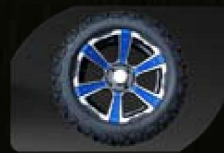
14" Color Matched Off Road Tire