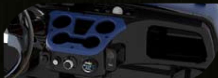
Color matched Dash with four cup holders/cell phone holder