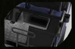
Plastic rear seat kit with storage & cup/cell phone holders