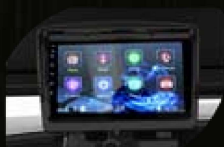
9 inch touchscreen with back-up camera