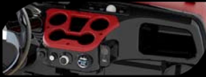
Color matched Dash with four cup holders/cell phone holder