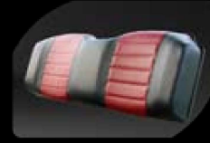
Two tone seat