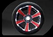
14"Alum Wheel with black insert/215/35R14 Radial DOT Tire