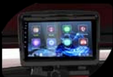
9 inch touchscreen with back-up camera