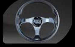
Luxury steering wheel