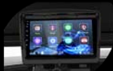
9 inch touchscreen with back-up camera