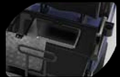
Plastic rear seat kit with storage & cup/cell phone holders