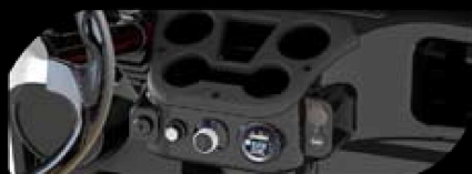
Black dashboard with four cup holders/cell phone holder