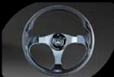
Luxury steering wheel